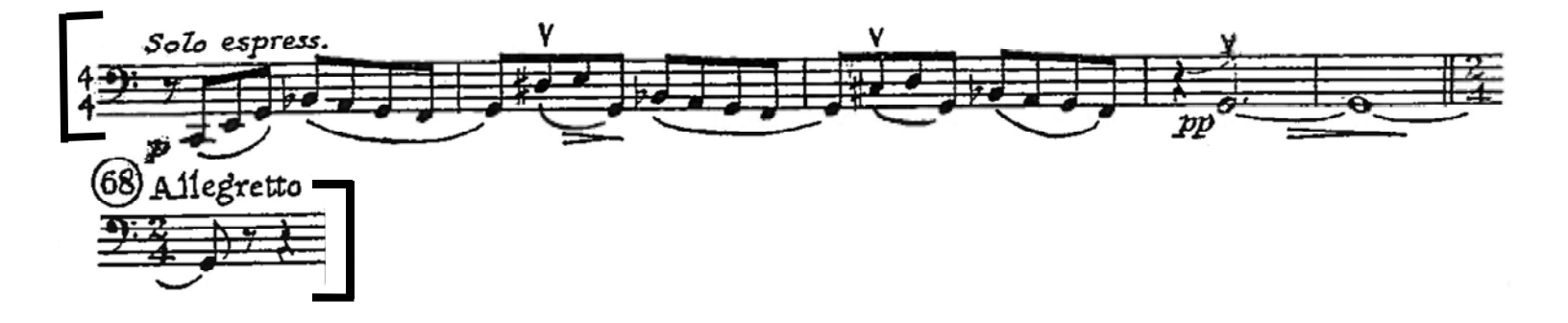
STRAUSS - Ein Heldenleben